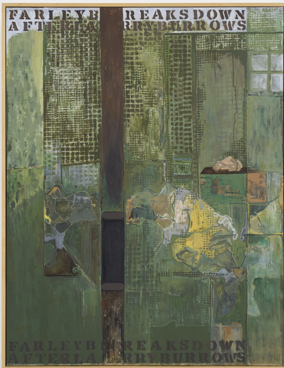
"Untitled" (2018), oil on canvas, displays a surfeit of greens — a color somewhat scarce in Mr. Johns's repertory.

Opposite the "Regrets" additions, the two untitled paintings that introduce what is likely to become known colloquially as the "Farley Breaks Down" series are isolated, side by side, on a wall. One is somewhat smaller than the other; both display a surfeit of greens — a color somewhat scarce in Mr. Johns's repertory. They initially appear abstract, with gentle push-pull tensions of plane and brushwork complicated by the imprints of steel mesh in three sizes (extra fine, fine and small). But the phrases stenciled across their top and bottom edges — "Farley Breaks Down/After Larry Burrows" — indicate an image, of Farley breaking down, made by someone