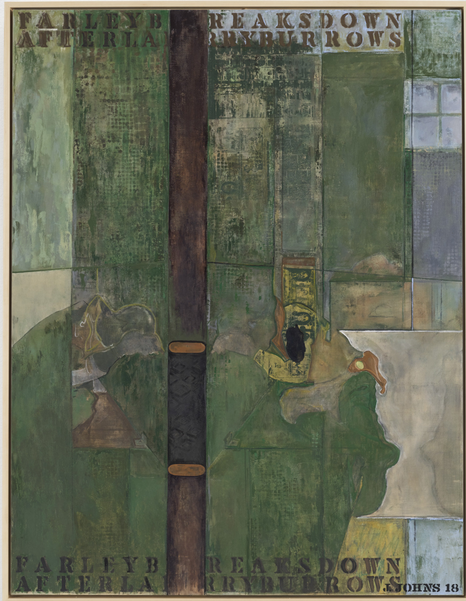
"Untitled" (2018), encaustic on canvas, is based on a photograph taken during the Vietnam War by Larry Burrows of Life magazine.

secondaries, their quasi-Cubist shatterings and flattenings create abstraction as a kind of mounting rubble, but Freud's face-shielding hand and arm are always discernible.