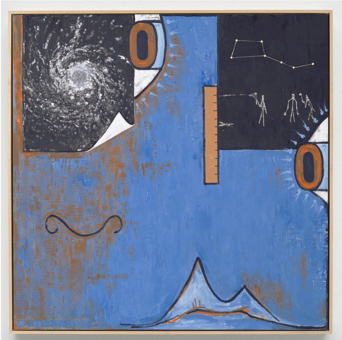
"Untitled" (2016), oil on canvas. Cartoon eyes with sunbeam lashes are paired with an inch-worm-like curl of nostrils floating free midfield.

Through April 6 at Matthew Marks Gallery, 522 West 22nd Street, Manhattan; 212-243-0200, matthewmarks.com .