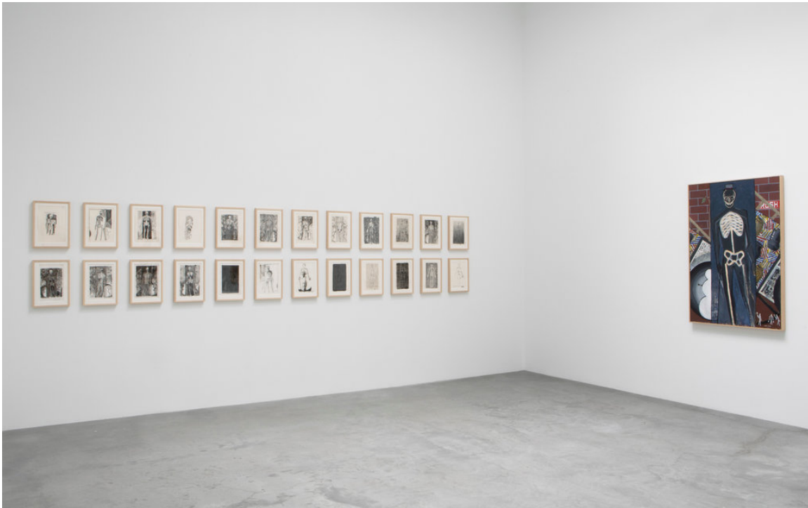
An installation view of the show.

In this series, “Regrets” turns dark, psychological and philosophical. They are among his first to be entirely photo-based, being derived from a damaged photograph of the British painter Lucian Freud, seated on a bed in his studio, hunched over, covering his face with his right hand. Mr. Johns took this seemingly anguished pose and amplified, fractured and distorted it by adding various patterns and combining the image with its reverse. This mirroring doubled the photograph’s deeply torn corner into a central shape resembling a tombstone. With very little encouragement, the stains and creases just above it emerged as a skull.