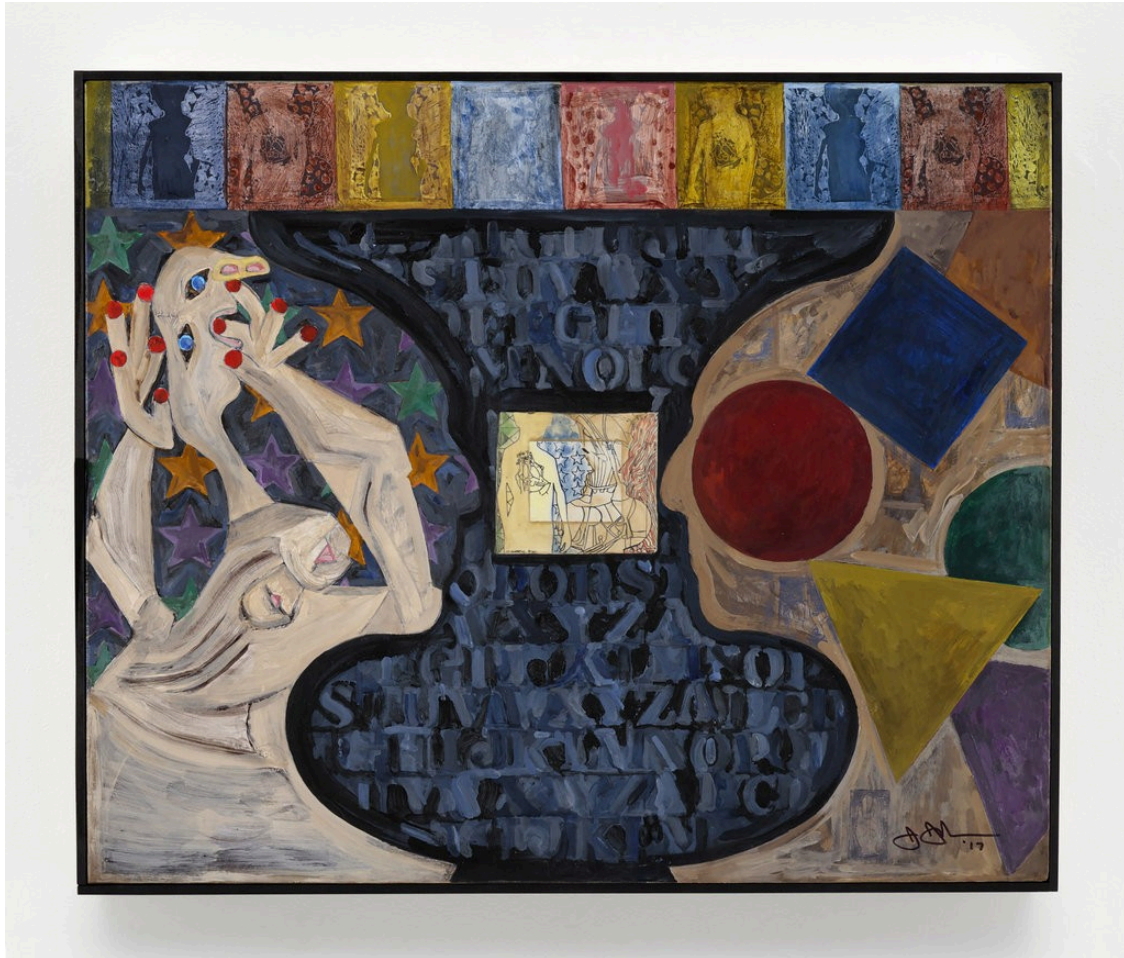
Jasper Johns's "Untitled" (2017), acrylic over etching with collage on canvas. It's among the works in his latest exhibition, "Recent Paintings & Works on Paper," at Matthew Marks Gallery in Manhattan.