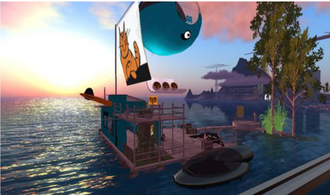
Chris Marker's virtual home on Second Life, May 29, 2009.