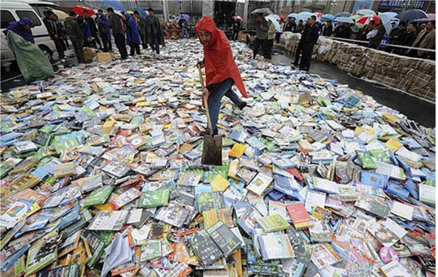
Shoveling pirated DVDs in Taiyuan, Shanxi province, China, April 20, 2008. From here .

dragged around the globe as commodities or their effigies, as gifts or as bounty. They spread pleasure or death threats, conspiracy theories or bootlegs, resistance or stultification. Poor images show the rare, the obvious, and the unbelievable—that is, if we can still manage to decipher it.