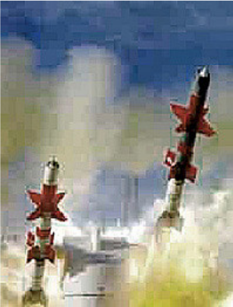
Thomas Ruff, jpeg r1104 , 2007.

the creation and dissemination of compressed and flexible data packages that can be integrated into ever-newer combinations and sequences. 12